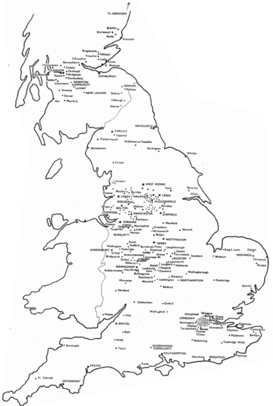
Figure 1: Co-operative societies in Britain before 1844