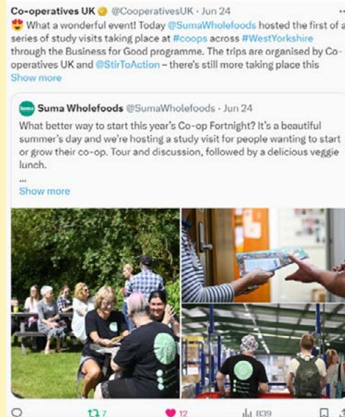
Example of social media activity following a study visit to Suma Wholefoods, a worker co-operative based in West Yorkshire.

Holmfirth Tech offered a study visit to organisations participating in the Business for Good West Yorkshire Programme delivered by Co-operatives UK and Stir to Action.