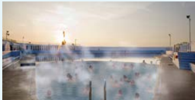
The Booster match funding incentivised local people to buy a share in the pool. The money raised will help develop it into an accessible geothermal pool, usable for 365 days a year