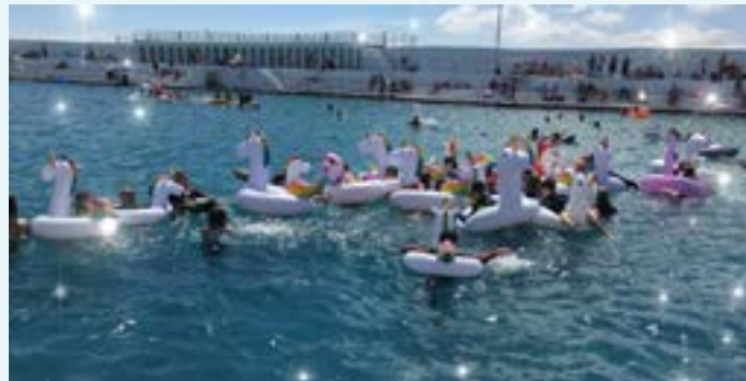
A unicorn derby day at Jubilee Pool